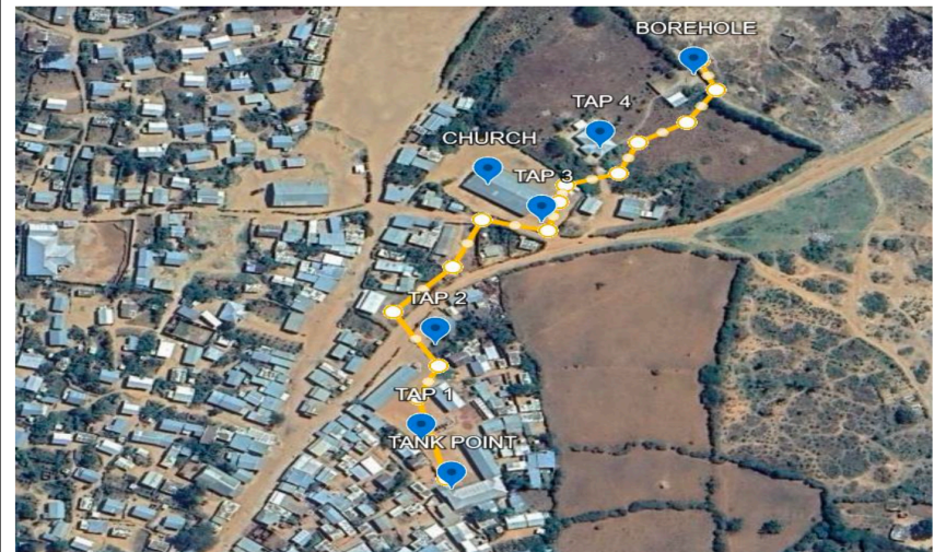
Google earth photo showing the transmission pipe network and the different tap locations

We are in the process of obtaining our own 501 (C)(3) IRS tax exempt status . This should greatly reduce the confusion when trying to financially partner with EmmausGO. The IRS application has been submitted and we now wait to hear from them. We have been told this could be lengthy and possibly declined pending more information. Please pray we will be patient, persistent and will find favor with the Lord and powers that be in this regard.